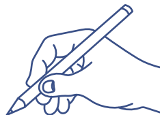
Pencil grip and pressure ✓